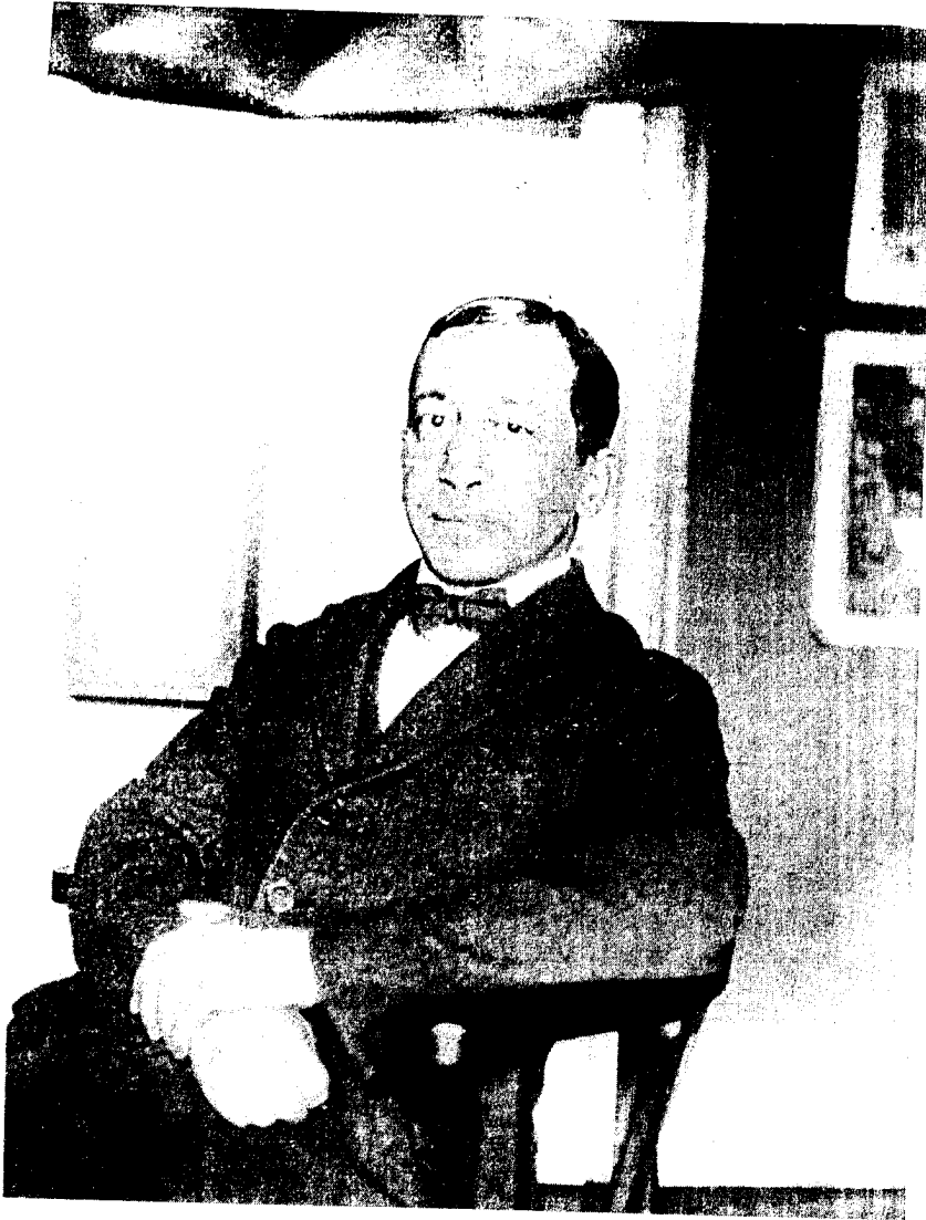
Siegfried Kracauer, late 1920s